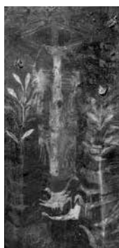
Fig. 1 Ruth Dorrit Yacoby, On the Night of All the Moons Ruth was Born , 2009–11, mixed media on wood panel, 250×100, estate of the artist

7 Haviva Pedaya, "Between the Sky and the Land," Ruth Dorrit Yacoby: Gate of Tears, Rain of Roses , exh. cat. (The Vatican, 2001).