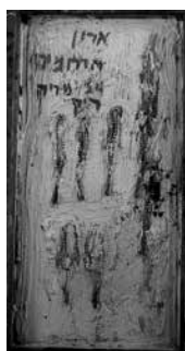
Fig. 2 Ruth Dorrit Yacoby, Mary's Mercy Cabinet is Empty , 2000–03, mixed media on wood, 122×62, estate of the artist

in turn led her to explore various religions and faiths. In 2001 she presented a solo exhibition, Gate of Tears, Rain of Roses , at the Vatican. 6 Pedaya wrote the main text in the exhibition catalogue, noting: