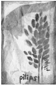
Fig. 3 Ruth Dorrit Yacoby, Untitled , 2010–12, paint and fabric on wood, 122×80, estate of the artist

and the New Testament. Referring to the Virgin Mary – believed to have conceived Jesus after being impregnated by the Holy Spirit without having sexual relations – Yacoby highlights the incongruity rooted in conceptions of womanhood, motherhood, and childbearing in monotheistic religions. In another series of paintings – housed in a set of shallow boxes – a female figure appears in progressive stages of disintegration. Blending in with her background, fragments of the silhouette are graced by desert debris such as stones, twigs, and sand. Clay burial candles and vessels adorn the bottom of the boxes, reminiscent of the pagan rituals of the region. As though emerging from the depths of the desert soil, these three-dimensional works demonstrate Yacoby's liberated exploration of death, burial, and bereavement.